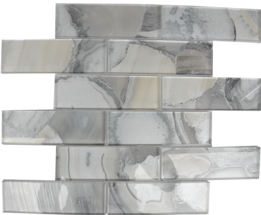
Light Grey GLAAGLG62